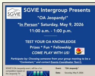
May 9 Trivia Game and Fellowship (Hybrid)