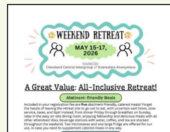
May 15–17 Weekend Retreat (Ohio USA)