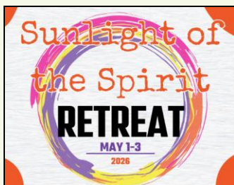
May 1–3 Weekend Retreat (Oregon USA)

Join us for special events, speakers, and fellowship. Check out Event Calendar on oa.org for more activities and ways to participate.